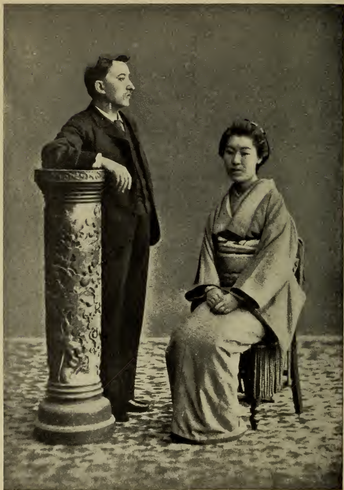
LAFCADIO HEARN AND HIS WIFE.